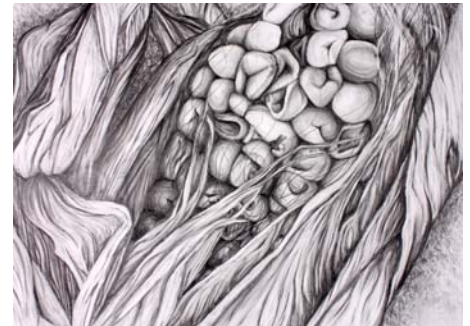
by: Rebecca Toderian - Gr. 12