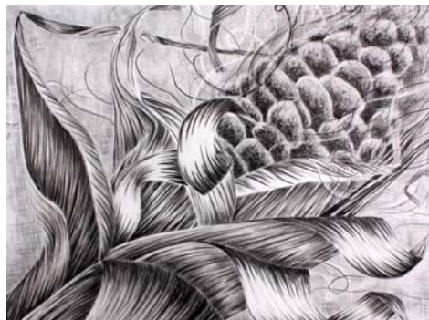
by: Megan Florizone - Gr. 12