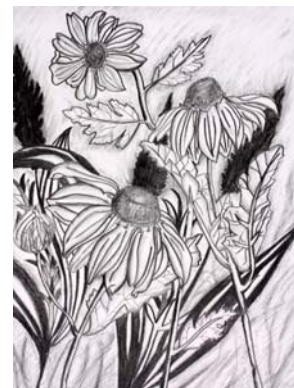
by: Air Amonpiticharoen - Gr. 10