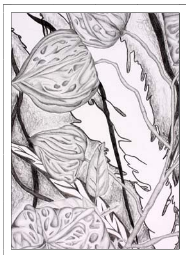
By: Emma Yeo - Gr. 12