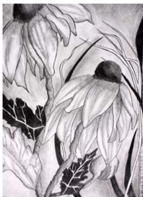
by: Emma Power - Gr. 10